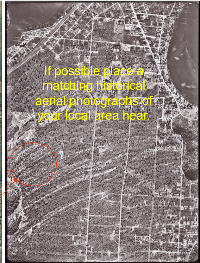
1941 Air Photograph