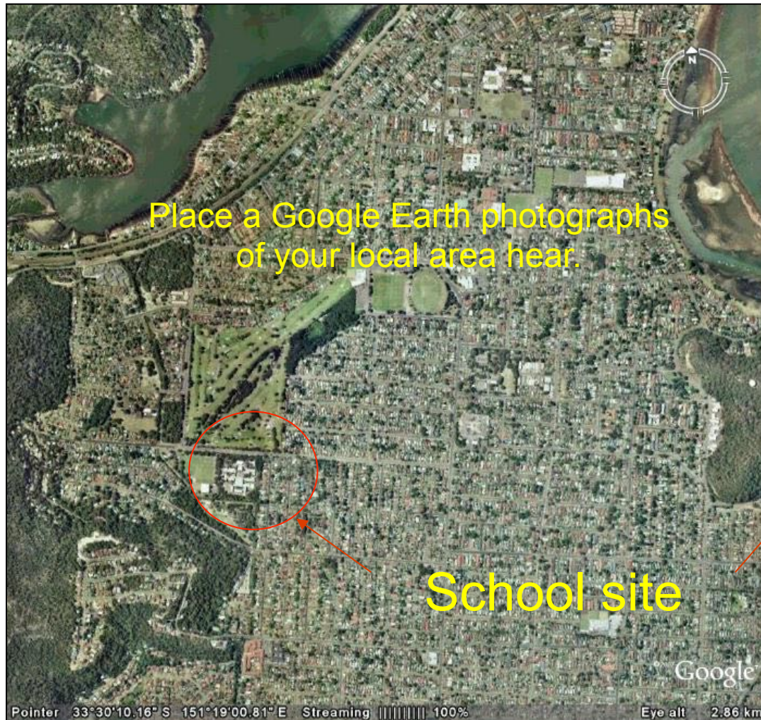
Recent Air Photograph

Loss of biodiversity often results from urban development. What changes have taken place in your local area?